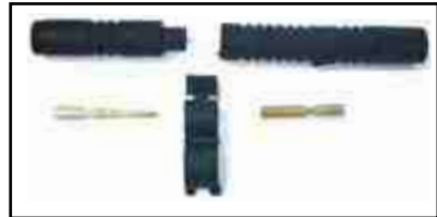
Primary plug and receptacle kit for unscreened cable