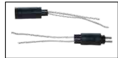
Secondary plug and receptacle after connection