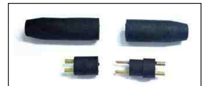
Secondary plug and receptacle