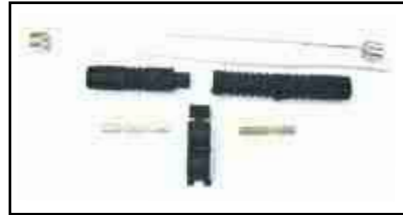
Primary plug and receptacle kit for screened cable