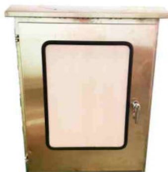
External Enclosure with Window housing the Controller unit