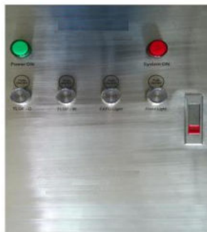
Internal view of Controller