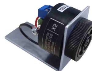
BPM-125D Panel Mount