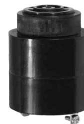
BPM-110A & BPM-220A