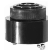
BPM-12D to BPM-48B