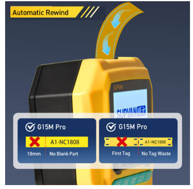
Supvan hand held printer G15M Pro Automatic rewind

Cable Tag, Shrink Sleeve, Wrap Label, Flag Label, Continuous label, Die cut label